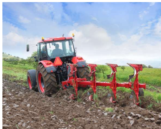
IBIS L 4+ REVERSIBLE MOUNTED PLOUGH