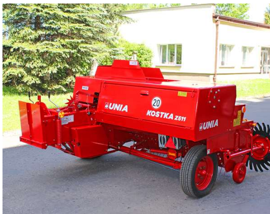
KOSTKA 2511 CUBE BALER