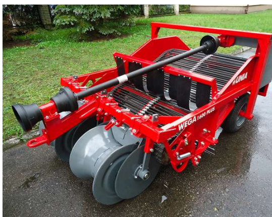
WEGA POTATO AND VEGETABLE DIGGERS