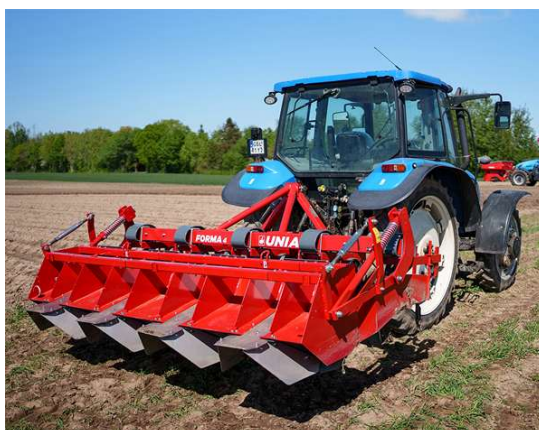
FORMA RIDGING PLOUGHS WITH FORMING DEVICE