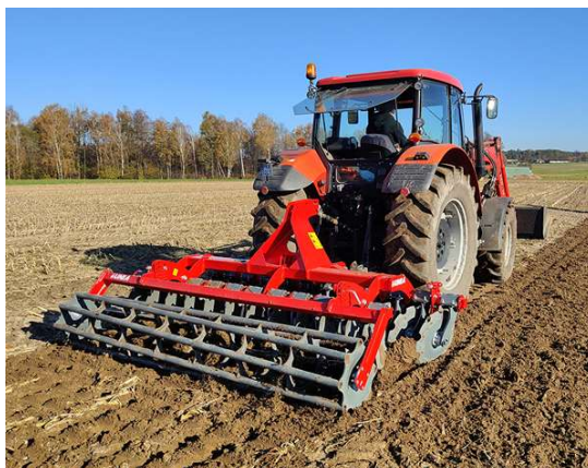
ARES L DISC CULTIVATOR