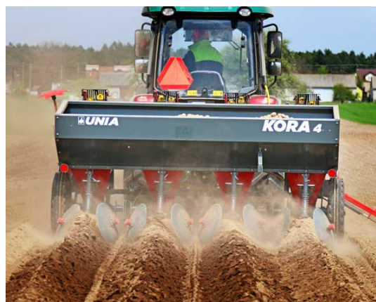
KORA POTATO PLANTER