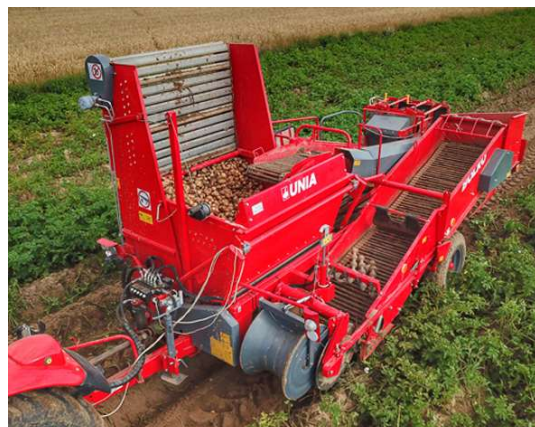
BOLKO POTATO AND VEGETABLE HARVESTER