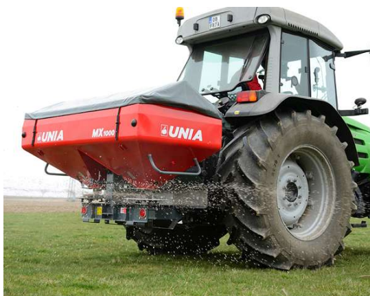
MX DOUBLE DISC FERTILIZER SPREADERS WITH SLOTTED SPREADING SYSTEM