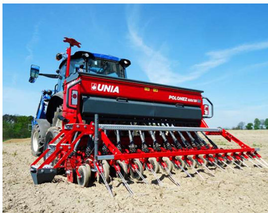
POLONEZ 550 MECHANICAL SEED DRILL