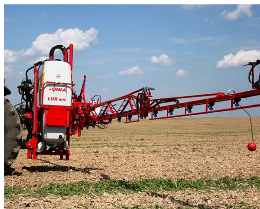
LUX MOUNTED FIELD SPRAYERS, HYDRAULICALLY UNFOLDED AND LIFTED BEAMS