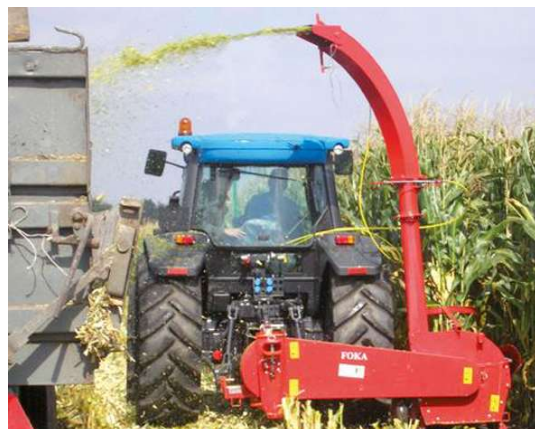
FOKA CUTTER BLOWER